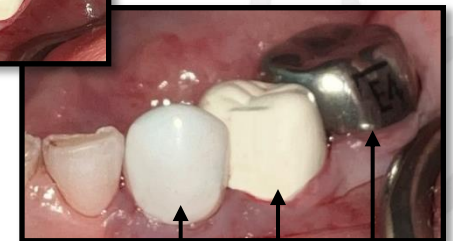
Zirconia Resin SSC