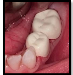
-side by side resin crowns-

The newest crown choice for primary teeth are Resin crowns . Resin crowns are made of a biocompatible, hybrid resin polymer. They are Bis-GMA free and do not contain metal. Zirconia or resin are a great option if children have a known nickel allergy, as we cannot use stainless steel. They are also white , but more opaque in color than Zirconia crowns. Because of this, they are best described as "off-white" or a more "bright white." They require much less tooth removal than their zirconia counterparts, but slightly more than SSCs.