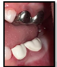
-SSCs (upper)- -resin crowns (lower)-

Additionally, the properties of the hybrid resin allow for flexibility and slight modifications to the crown itself. It truly is the first "flexible white crown" available for baby teeth. While research shows robust wear resistance, equal to that of SSCs and Zirconia, resin crowns are a relatively new product. Time will tell how they hold up to the 'tried and true' stainless steel crowns and the esthetics of the zirconia crowns.