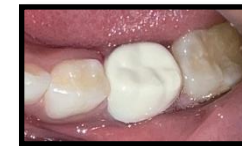
-single tooth resin crown-

Additionally, the properties of the hybrid resin allow for flexibility and slight modifications to the crown itself. It truly is the first "flexible white crown" available for baby teeth. While research shows robust wear resistance, equal to that of SSCs and Zirconia, resin crowns are a relatively new product. Time will tell how they hold up to the 'tried and true' stainless steel crowns and the esthetics of the zirconia crowns.