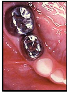
-side by side SSCs-

Stainless steel crowns have been used in pediatric dentistry for over 60 years. Because of their long history in clinical dentistry, SSCs have been thoroughly researched. Studies show excellent reliability and success, making them our "go to" crown choice for years. They are silver in color and are made of nickel, chromium and iron. They bend and flex, and can be adjusted to fit a tooth or in areas of space loss/crowding.